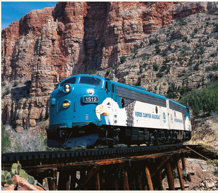
Journey aboard the Verde Canyon Railroad

This morning, stop in Jerome, an old mining town and melting pot for those who dreamed of making a quick fortune. Once virtually a ghost town, it is now restored with shops, museums and art. Later, climb aboard the Verde Canyon Railroad for a spectacular journey over old-fashioned trestles, past ancient Indian ruins and through a 700-foot tunnel. Enjoy the views from the comfort of your First Class seat or from one of the open-air viewing cars. Watch for wildflowers, blooming cacti and wildlife in their natural habitat. Tonight, chow down with a chuckwagon supper at the "Blazin' M Ranch" and Western Stage Show. Meals: B, D